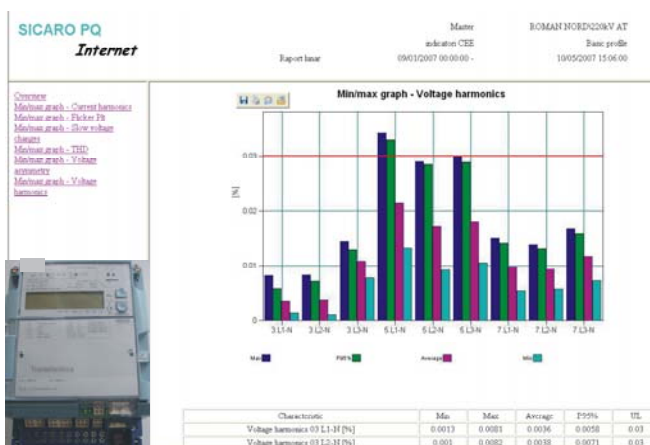
Fig. 2. The second PQ system report

The parameterization, measured value acquisition, event analysis and reporting are managed by Simeas Q PAR, Sicaro Q Manager and Sicaro PQ software [6]. 'Statistical analysis of network quality' reports according to [4], for admissible limits according to [1] are issued automatically for weekly analyse of cumulative probabilities 95%, maximum, minimum, and average values. Monthly these reports are sent to the National Dispatch. The reports are generated like an overview, presenting numerical and graphical analyses of the PQ parameters: power frequency, supply voltage magnitude, supply voltage unbalanced, total harmonic voltage, voltage harmonics, current harmonics, flicker P_{It} , slow voltage changes. All are exported to HTML files, with links for each PQ parameter, as shown in figure 2.